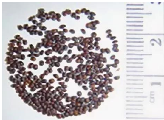
Figure 1. Seeds of Nepeta cataria

Defrosting after freezing is carried out in 2 variants: a) rapid defrosting in water bath (40 °C) for 10–15 minutes; b) slow defrosting at room temperature (22–23 °C) for one hour. Seeds stored in the refrigerator (+5 °C) for 30 months were used as control variant.