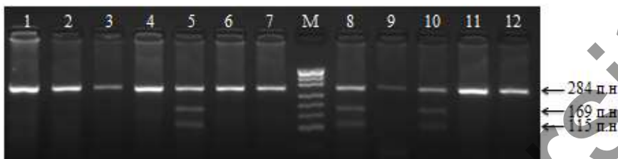
Figure 2. Electropherogram of LCORL gene amplicon after restriction digestion with AluI, lanes 5, 8, 10 - TC heterozygous genotype, fragments of 284 bp, 169 bp, and 115 bp, lanes 1-4, 6-7, 9, 11-12 - TT homozygous individuals with 284 bp fragments, M - DNA marker pUC19/MspI