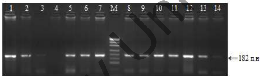
Figure 3. Electropherogram of the PCR product of the PRKAG3 gene. Lane 4 shows negative results, while lanes 1-3, 5-7 and 8-14 show a PCR product with a size of 182 bp., M - DNA marker pUC19/MspI