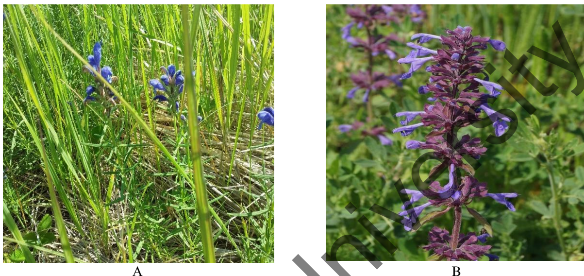
Figure 1. Dracocephalum ruyschiana (A) and Dracocephalum nutans (B) in the flowering phase

The raw materials were dried to an air-dry state, crushed to a particle size of 2 mm, packed in kraft-paper bags and stored in a cold dry place [11].