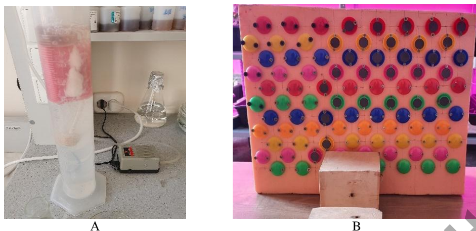
Experiment variants: A — seed aeration; B — setup for seed treatment with a magnetic field