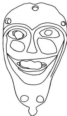
Figure 3. Guise. Object 2, Belokamenka burial ground, excavations of A.S. Ermolayeva

nose continues higher, diverges in different directions above the level of the eyes and thus forms a line of eyebrows in the form of arched figures. The chin is narrow. There are small circles at the level of cheeks close to the face. The plates for the hole are equally decorated— in the form of a rounded shape. The first guise has a small mouth in the form of a straight short line. The headdress covers the upper half of the head. The upper part consists of several teeth. The guise completely occupies the surface on a trapezoidal plate, in the lower part of which is attached an oblong drop-shaped figure with a rounded end.