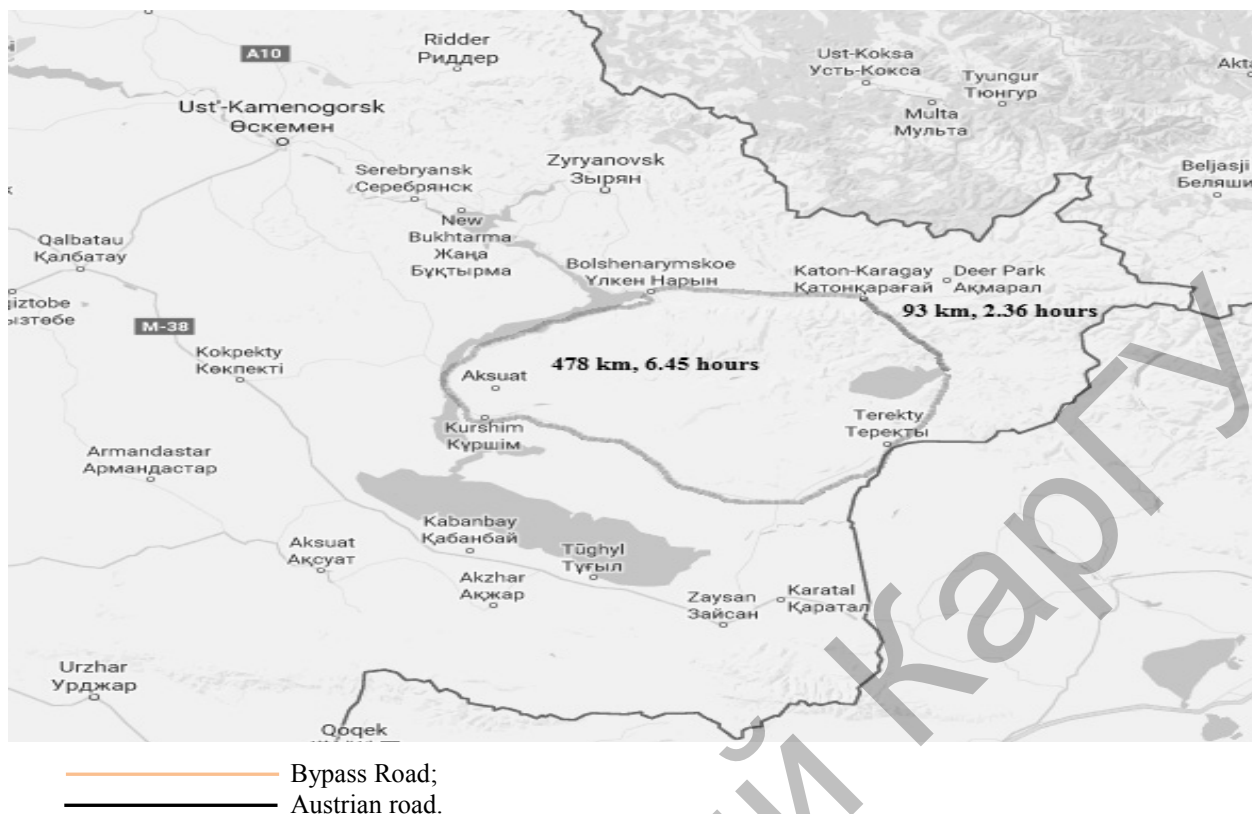
Figure 3. Map of bypass road between Katonkaragay NSTP and Markakol NTR (prepared on the basis of the authors [11])

East Kazakhstan region, cross-border tourist destination, both as an object of clusters that Nature and Katonkaragay will see that there are obstacles to urban areas: the distance from the road; bypass inconvenient; take more than one day; how to use the hotel; should stop catering facilities; Rise in the cost of the tour; be slow customs procedures, etc.