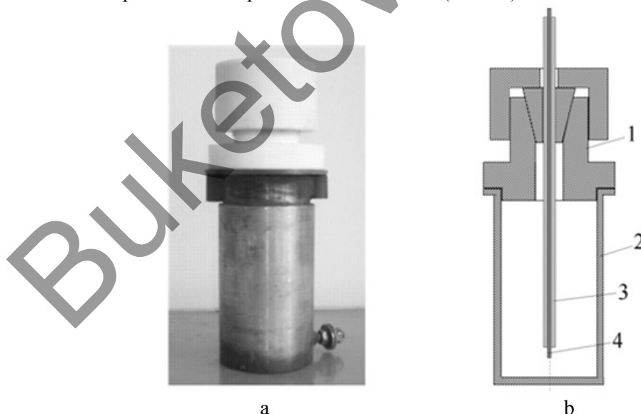
Fig.1. Working channel of the electric pulse installation: a) main view; b) scheme;

As a working medium, industrial water was used, which is cost-effective and affordable. After treatment with electric pulse discharges to separate the coal powder from the water, the water mixture was first settled, then the finished product was separated from the water (filtered) and dried at a temperature of 20 °C.