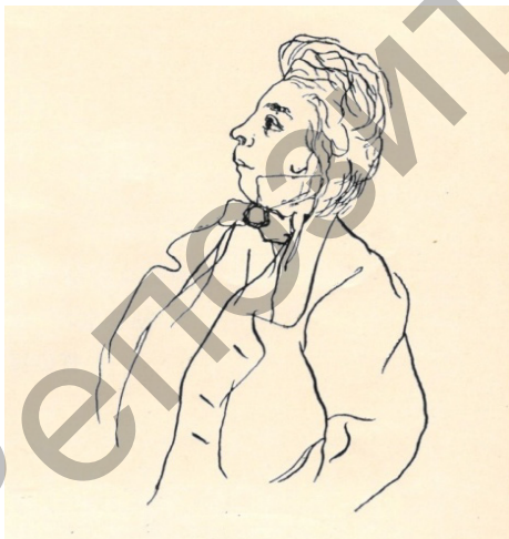
A portrait of Ye.P. Kovalevskiy. Pen. 1860

In St. Petersburg, Chokan sketched out a portrait of Yegor Petrovich Kovalevskiy, a famous traveler, diplomat, orientalist, Honorary Member of the St. Petersburg Academy of Sciences.