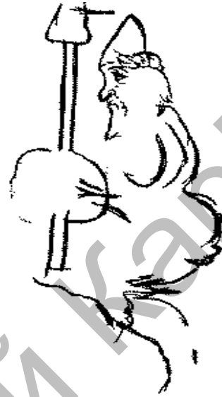
Baksy – a singer with a kobyz. Paper, pencil, pen. 1862