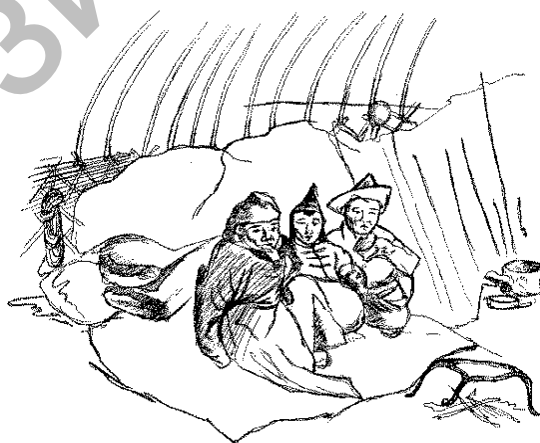
A group portrait of the brothers. Paper, pencil, ink. 1855