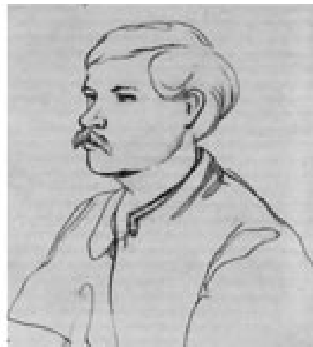
A portrait of G.N. Potanin. Pencil. 1857

A number of sketches are devoted to depicting the type of the Kazakhs of the Senior Zhuz.