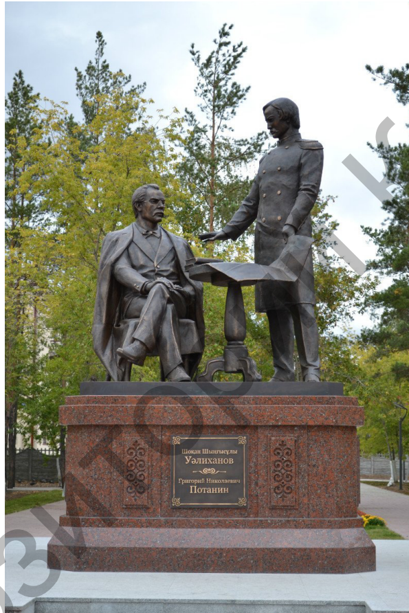
A monument to Ch. Valikhanov and G. Potanin. Pavlodar. 2012

By fate the friends had different life paths: G. Potanin lived a long life, C. Valikhanov died in the prime of his life, but their creative and spiritual contact was eternal. In 2012, a monument to two world-renowned scientists was erected in Pavlodar. The monument became the embodiment of «friendship for life».