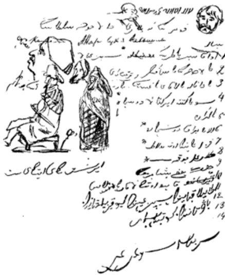
Kazakh musicians. Paper, ink, pen. 1862

This characterizes Valikhanov's observation, the features of his manner of drawing, which are swiftness, plasticity, laconic expressive means.