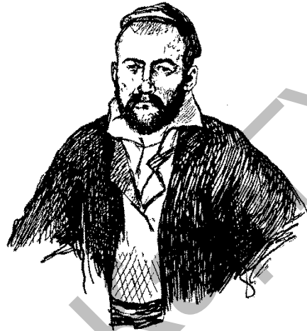
A portrait of uncle Kangozha. Paper, pencil, ink. 1862