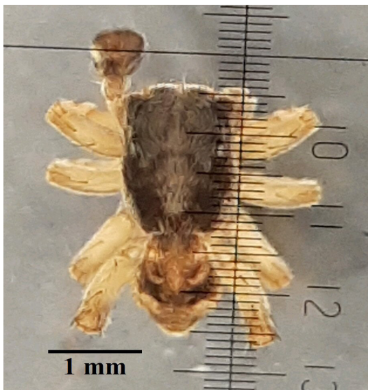
a — Attulus fasciger (Simon, 1880), male habitus. Magnification — 8x

According to previous publications of other researchers, we assume that Attulus fasciger (Simon, 1880) was recorded for the first time from Kazakhstan and Almaty city in particular [21-23]. It was considered by Jerzy Prószyński in 1968 [24] as a synonym of Attulus godlewskii (Kulczyński, 1895) — morphologically similar to A. fasciger species, that resides in West Asia and described by Kulczyński from a single, damaged female specimen. Later, Prószyński revived A. godlewskii and A. fasciger as valid species (self-correction) [22]. However, in publications both of these species were recorded in the Kazakhstan exactly [7, 20, 25, 26].