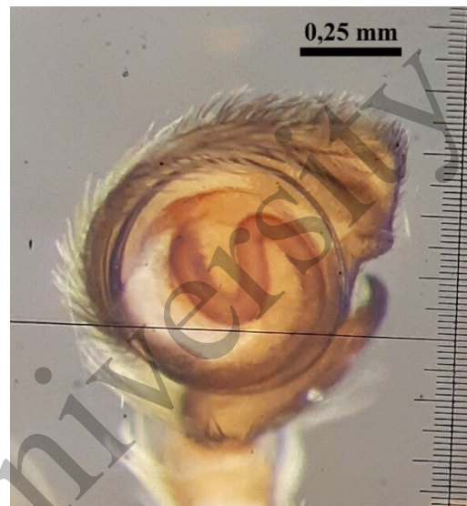
b — Attulus fasciger (Simon, 1880), male left palp. Magnification — 56x