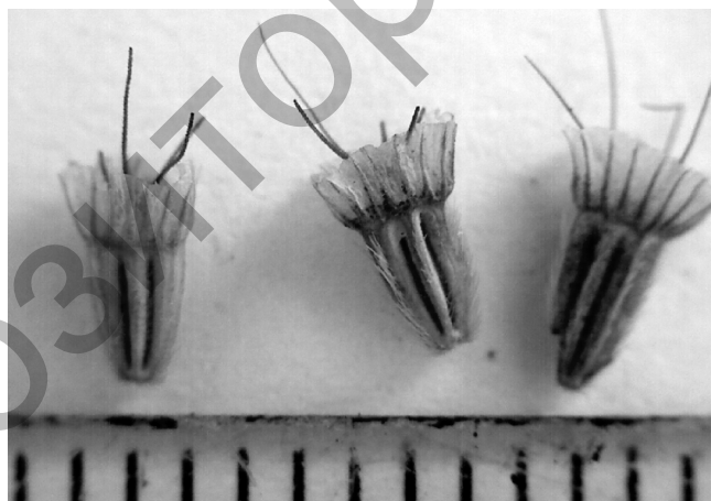
Figure 1. Internal view of seed materials of Scabiosa ochroleuca

The fruit Scabiosa ochroleuca is an achene with a serrated-wavy film crown, light brown, single-seeded, with an oily endosperm, pericarpium 8-sided deep-notched, cone-shaped. The length is 1.5–2 cm; the width is 0.4–0.6 cm. The shape of the seed is kidney-shaped, oval or rounded (Fig. 1).