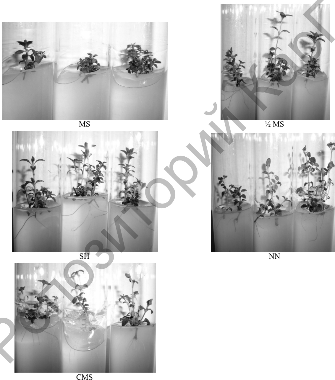
Figure 3. Shoot regeneration from nodal explants of T. serpyllum L. in different media after 3 weeks of culture

An intensive growth of the shoots was observed on modified Collet culture medium. After 3 weeks of cultivation, the shoots on culture medium CMS differed from the shoots on culture media MS, \frac{1}{2} MS, SH (Fig. 3). They had light-green color, but the shoots on culture media MS, \frac{1}{2} MS, SH — dark-green color. After 6 weeks of cultivation, the shoots on culture medium CMS had an average length 5.78 \pm 0.7 cm, the frequency of rooting formed 95 %; an average length of roots was 2.60 \pm 0.5 cm (Fig. 4, 5). The multiplication factor was 1:7.