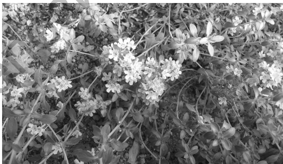
Figure 1. Thymus serpyllum L. in greenhouse

Thymus serpyllum L. is a species of a flowering plant in the mint family Lamiaceae (Fig. 1). The creeping thyme is spread throughout the whole territory of the Commonwealth of Independent States including Kazakhstan, the Russian Federation, and the Ukraine, especially on Polesye, in Siberia and in Caucasia. Thymus serpyllum L. grows in a temperate zone of Eurasia spreading in the north up to Murmanskaya oblast of the Russian Federation (Kandalaksha), as well as up to Northern Caucasia and the Crimea. In the Ukraine and in Kazakhstan Thymus serpyllum L. is spread almost everywhere with the exception of Central Kazakhstan. Thymus serpyllum L. is also found at the foothills of Tibet, in the north of India and in North America. In Armenia Thymus serpyllum L. has been grown as a garden culture for a long time [1].