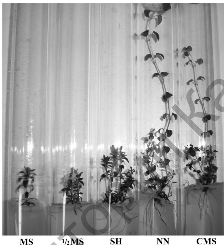
Figure 4. 6-weeks-old plants of T. serpyllum L.

Modified NN medium differ from MS, 1/2MS, CMS, SH by 100 % reduction in KI and CoCl 2 ·6H 2 O; increase of H 3 BO 3 and ZnSO 4 ·7H 2 O; reduction in CuSO 4 ·5H 2 O and thiamin-HCl; presence of folic acid and biotin. On culture medium NN there was observed an intensive shoot formation and the growth of the shoots into length. The color of the shoots was light-green (Fig. 3, 6). After six weeks of cultivation of the creeping thyme on the given culture medium, an average length of the shoots amounted to 7.13±0.9 cm, the frequency of rooting — 92.5 %, an average length of roots — 1.52±0.4 cm (Fig. 4, 5). The multiplication factor was equal to 1:9.