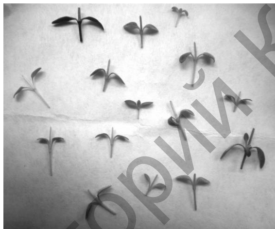
Figure 2. Initial explants — nodal segments of Thymus serpyllum L.

Cultivation of initial explants (Fig. 2) till the formation of plantlets was conducted on 5 different culture media.