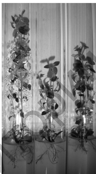
Figure 6. 1-month-old plants of T. serpyllum L. on NN culture medium

On all the culture media, formation of roots was going on without formation of the callus. The longest ( 7.13 \pm 0.9 cm) shoot length, the smallest ( 1.52 \pm 0.4 cm) root length and the highest multiplication factor 1:9 were recorded on NN medium. Our data show that at cultivation of the creeping thyme in vitro, composition of the mineral basis of culture medium play a defining role for different elements of organogenesis: NN medium was an optimal for the growth of the shoots, CMS and NN media — for formation of roots, SH medium — for the growth of roots.