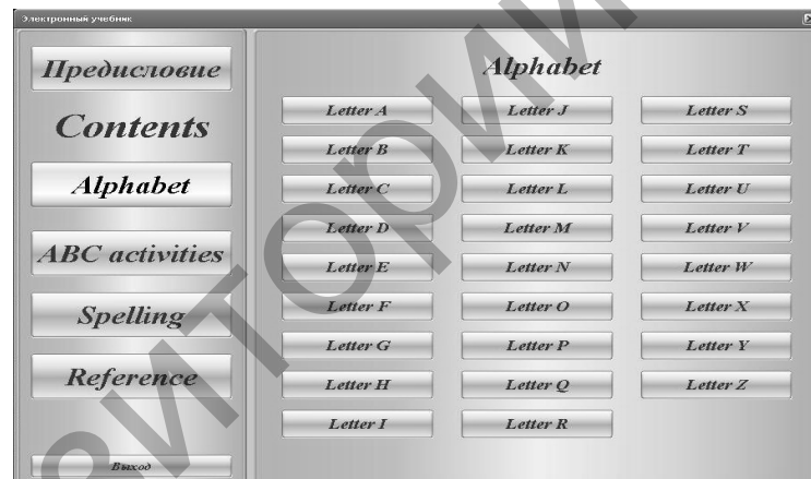
Figure 3. Structure of the electronic textbook for the course «Alphabet and Spelling in Pictures for Primary School»

The edition « Alphabet and spelling in pictures for primary school » on paper and electronic media is offered to be used in the second half of the year for class and homework assignments that form initial reading and writing skills, along with grammatical and lexical skills (Fig. 3). The edition includes a system of exercises aimed at the interrelated development of pupils' speaking, reading and writing skills in the learning process; the development of the foreign-language reading and writing techniques and the development of the ability to independently read and write simple words and short sentences.