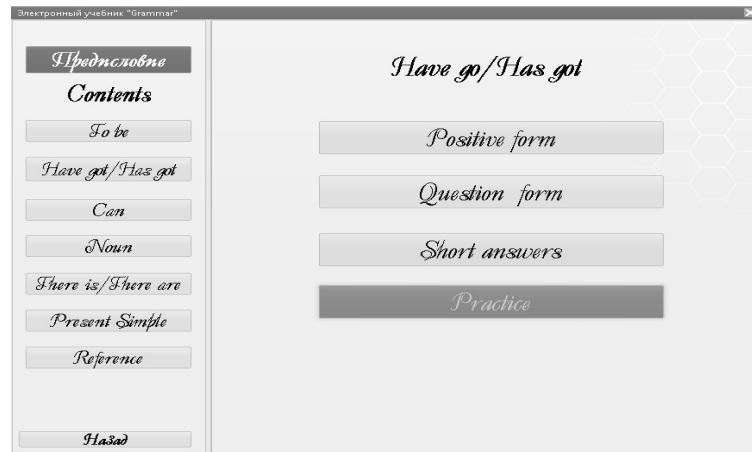
Figure 2. Structure of the electronic textbook for the course «Grammar in Pictures for Primary School»

The edition « Alphabet and spelling in pictures for primary school » on paper and electronic media is offered to be used in the second half of the year for class and homework assignments that form initial reading and writing skills, along with grammatical and lexical skills (Fig. 3). The edition includes a system of exercises aimed at the interrelated development of pupils' speaking, reading and writing skills in the learning process; the development of the foreign-language reading and writing techniques and the development of the ability to independently read and write simple words and short sentences.