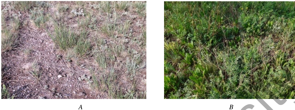
Figure 1. Area with suppressed (A) and close to natural (B) vegetation cover

visible signs of soil degradation. The second soil sample was collected in an area where the natural state of vegetation and soil horizons was preserved (Fig. 1).