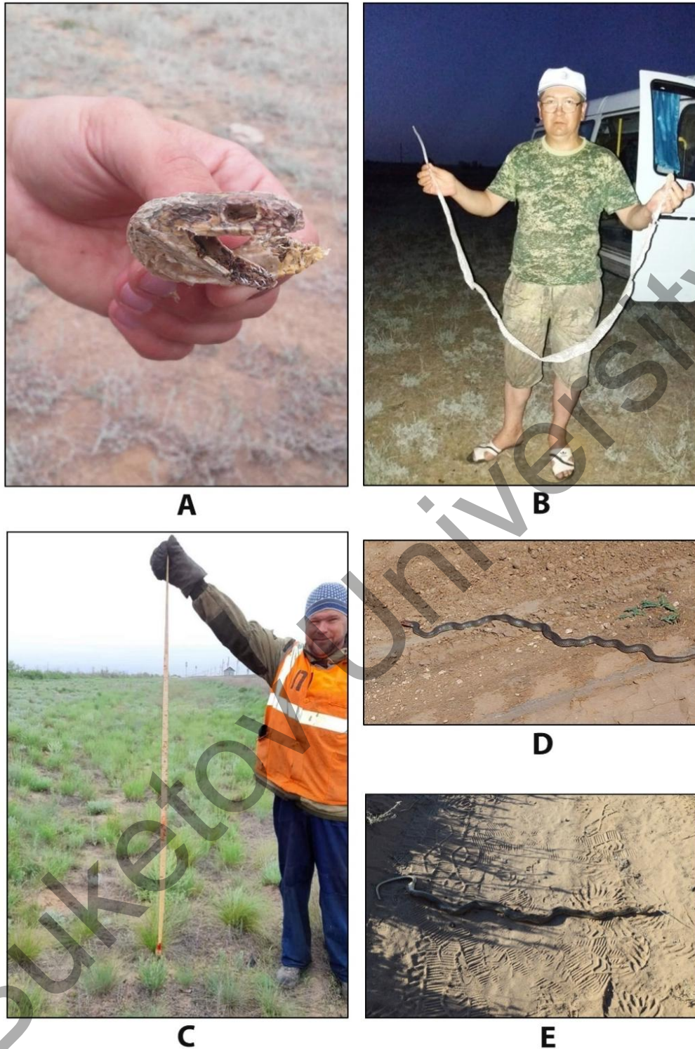
Figure 2. Dolichophis caspius encounters in the Bokeyorda District of the West Kazakhstan Region of the Republic of Kazakhstan: