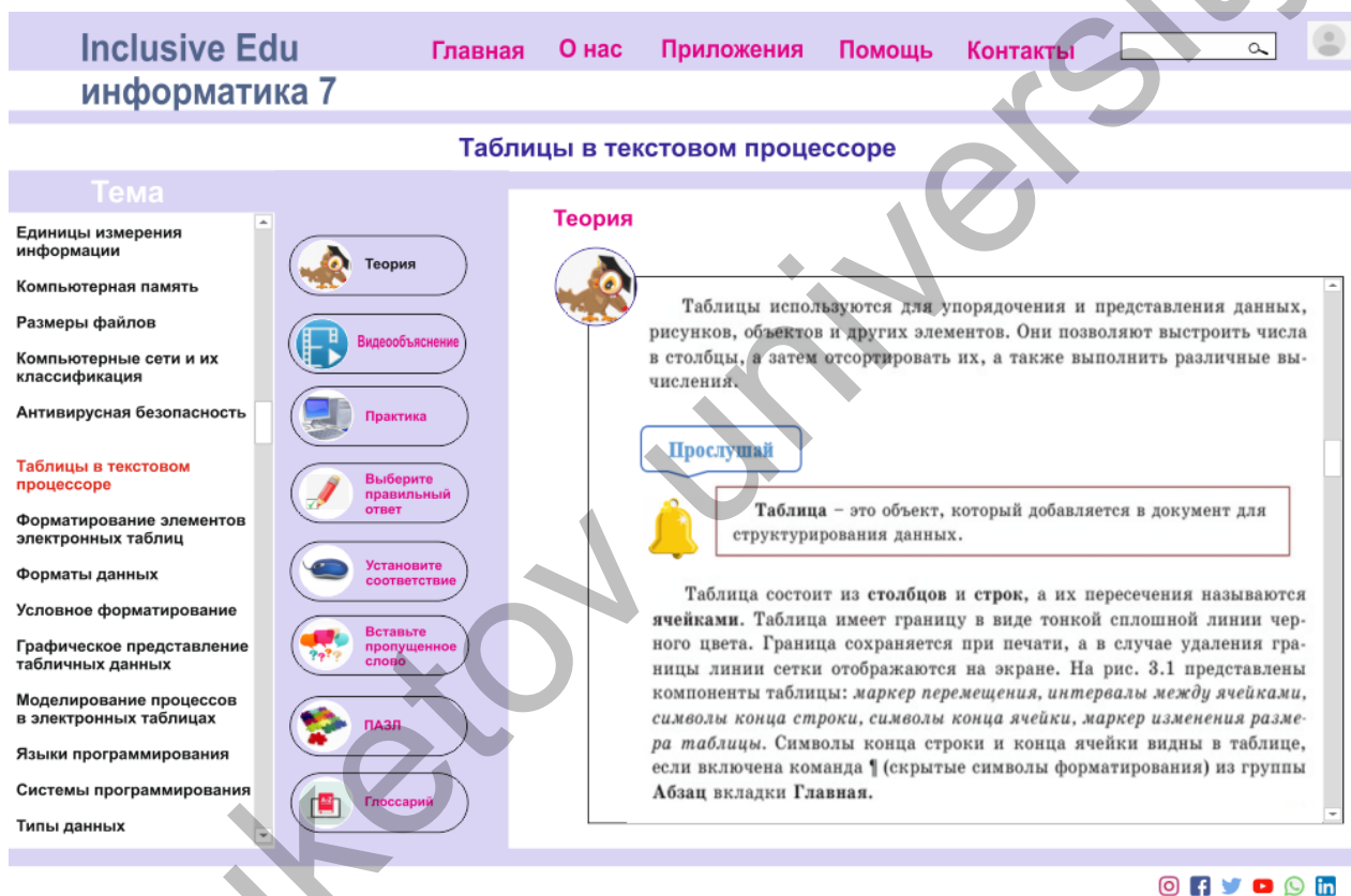
Figure 1. Content of Software “Inclusive Edu – Information Science, Grade 7”

Software content (Figure 1) includes relevant and functional topics in accordance with the standard curriculum of the Republic of Kazakhstan in Information Science, grade 7.