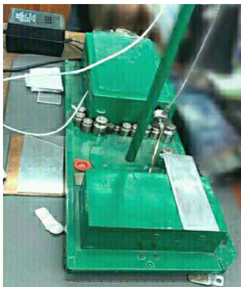
Fig.2. Information - measuring device for determining the coefficient of sliding friction.

the bath, the part was washed in an ultrasonic bath and treated with steam using a steam jet device, wiped with coarse calico soaked in ethanol and placed in a drying cabinet and kept in it for two hours at a temperature of 150°C.