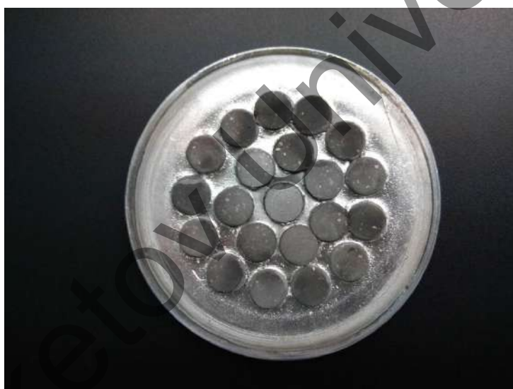
Fig.1. View of the target, consisting of a matrix and 21 disks.

At the next stage of manufacturing targets for magnetron sputtering, disks 12 mm in diameter and 3 mm thick were created from micropowders pressed using a hydraulic press (20 tons). The small size of the discs was due to insufficient pressure to press the larger discs. After pressing, the discs were sintered in a vacuum furnace at a temperature of 800°C for two hours and then cooled in a residual vacuum to room temperature. Due to the small size of the discs, a steel matrix (steel 08) was made in the form of a disc 100 mm in diameter and 10 mm thick. Round 3 mm recesses were milled into them with a diameter to fit the dimensions of the manufactured targets, which were then inserted into the matrix on a "hot" one. Fig.1 shows a view of an already working target, which consists of a matrix into which disks are inserted. The composition of the disks consists of Cr-Ni-Ti-Fe-Cu.