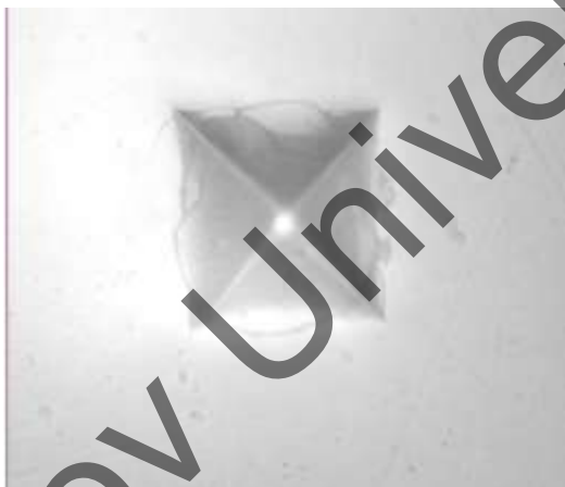
Figure 1. Image taken during microhardness measurement (400 magnification).

In the first series, a TiN + CrN coating was deposited on the substrates without an intermediate Cr layer. The St3 steel substrate showed a low Vickers microhardness (194 HV) measured on an HVS-1000A instrument. The adhesion of the deposited TiN + CrN layer also turned out to be low. Probably, this led to the fact that the film cracked when trying to measure its microhardness. The crack is quite well observed along the circumference of the indenter, which is shown in Figure 1.