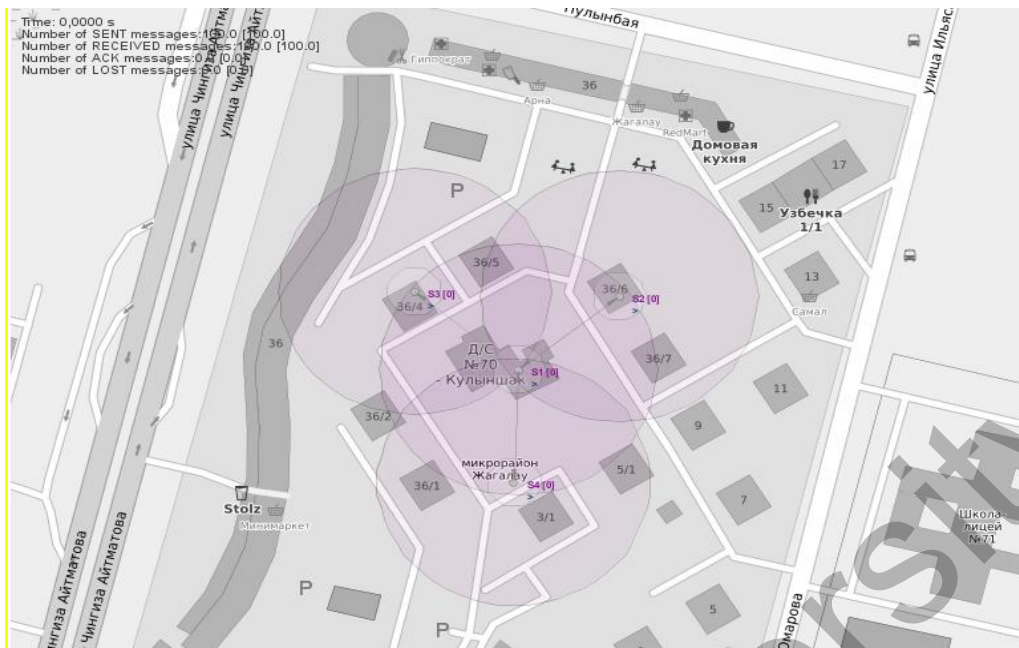
Figure 1. Sensory nodes

The next step is to apply the script to the sensor nodes and run the simulation of the simulated network. When the simulation ends, the End of Simulation message will pop up on the screen (Figure 2).