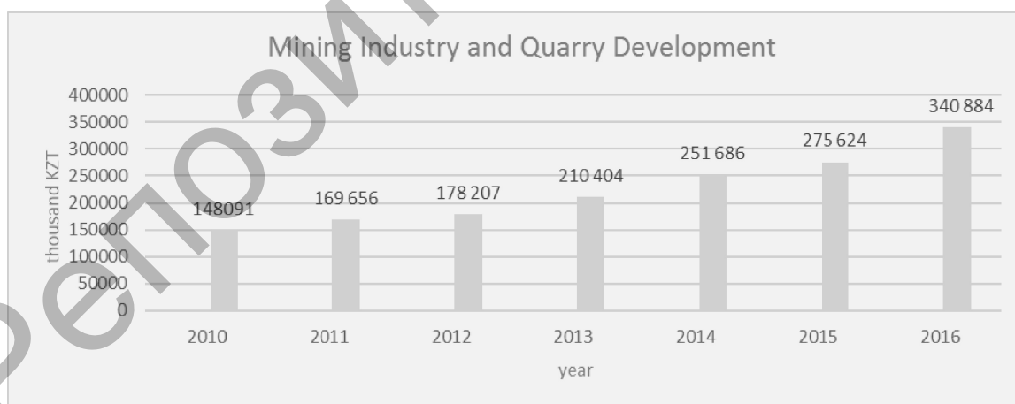
Figure 1. Average monthly salary level in the mining industry (nationwide data) (source: [1])

The average monthly salary in the mining and smelting industry is one of the highest in Kazakhstan (Fig. 1).