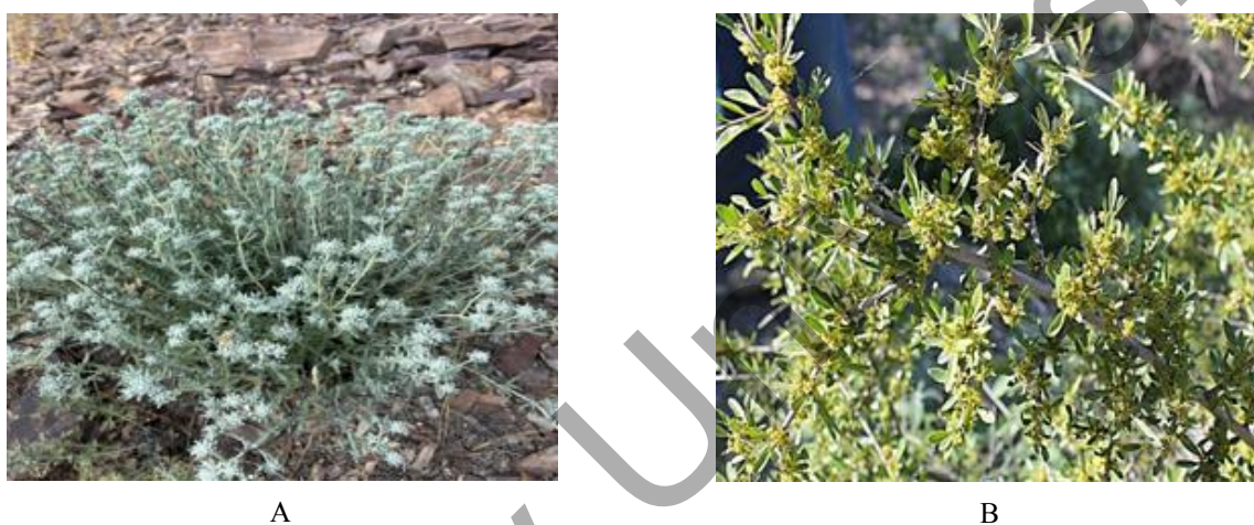
Figure 2. Teucrium polium (A) and Rhamnus sintenesii (B)

Criterion A (iii) — presence of Red Book species — Crambe edentula , Rhamnus sintenesii (Fig. 2), Armeniaca vulgaris , Artemisia gurganica , Rubus caesius , Teucrium polium . Criterion B is high floristic diversity of IPA, including 58 species of higher plants. Criterion C — the habitat is occupied by slightly disturbed communities of low-mountain vegetation.