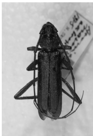
Picture 4. Turkaromia pruinosa