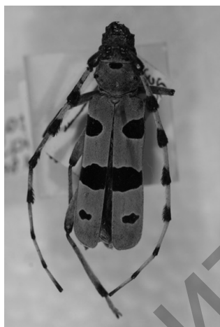
Picture 2. Rosalia alpina

It was also found the presence of two species in the collection of Cerambycidae, which are included in the Red Book of Kazakhstan. It — Dorcadion balchashense (Picture 3), which belongs to the category III environmental significance — a rare species, and Turkaromia pruinosa (Picture 4), which refers to the importance of environmental protection category II — a decreasing species.