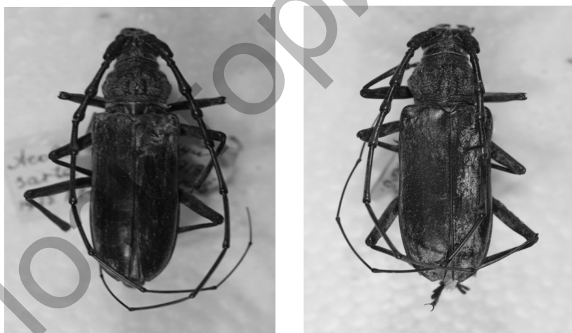
Picture 5. Aeolesthes sarta

Another unique collection is a copy — Aeolesthes sarta (Picture 5). The age of this beetle is nearly 100 years old. Beetle was founded in 1917 in the town of Chardzhou (now Turkmenabat) in Turkmenistan and the museum received in exchange for Kazakh species. Availability of long-stored specimens is important for studying the dynamics of morphometric parameters of the family.