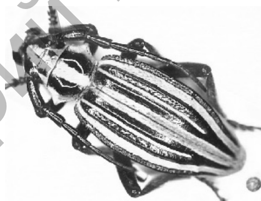
Picture 3. Dorcadion balchashense