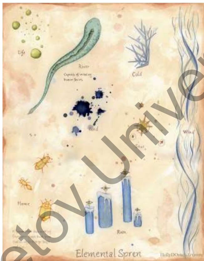
Figure 2. The spren types

When considering these words in pragmatic aspect, we can assert that the author has perfectly coped with the task of giving them a context. In the structure of the sentences, one can easily see the interaction of the concept with its notion. For example, the word spren occurs 3200 times in overall six works and represents one of the leading concepts of this cycle.