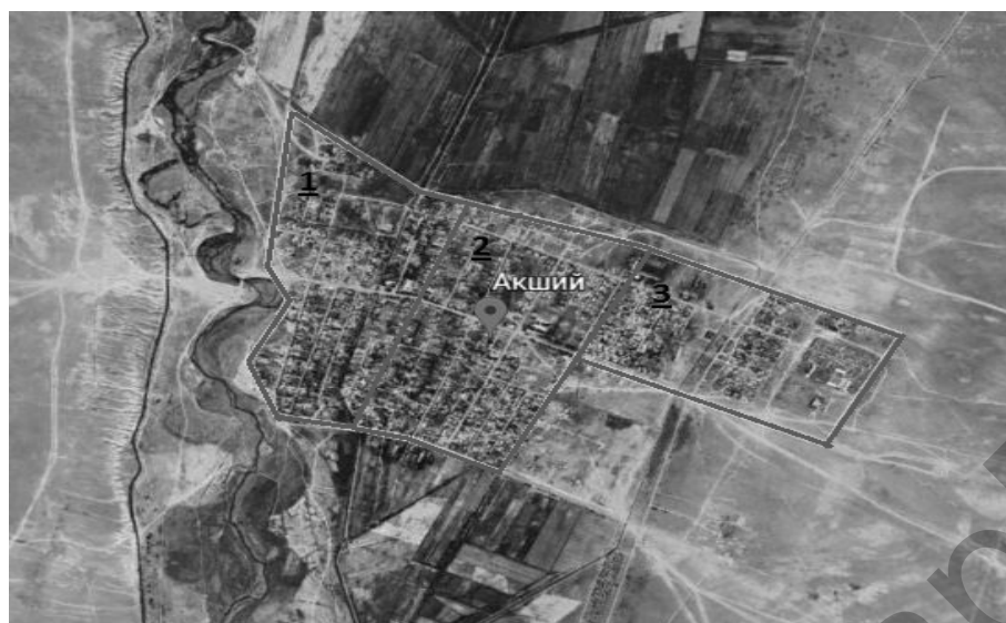
Figure 1. Pasture points where environmental monitoring is carried out with the help of Google Earth-maps