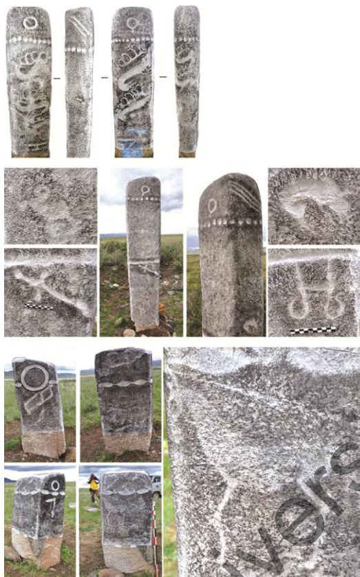
Fig. 3. Eastern Kazakhstan. Deer stones. Zhartas and Oishilik [13; 44–46].

The movement of Deer stones and statuary sculptures recorded by archaeologists in the Era of Early nomads from East to West, from Ordos and Mongolia to the Black Sea steppes, as an integral and important part — the animal style in the Scythian triad is considered by many researchers as evidence of the origin of the Scythians from the depths of Central Asia (Dzungaria) and, accordingly, was called the Dzungarian hypothesis [20], [27; 171–193], [28–29], [30–31], [32; 133–139].