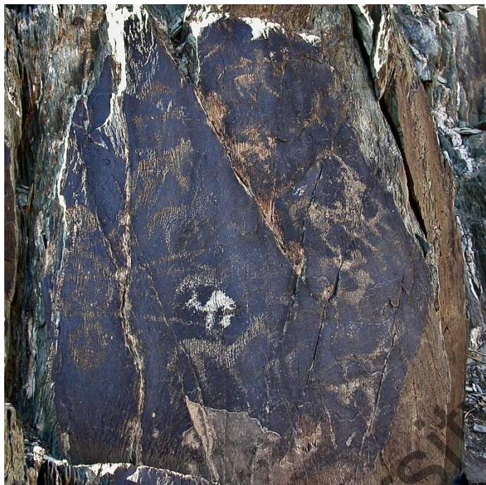
Fig. 2. Southern Kazakhstan. Ankeldy Petroglyphs. General view of the surface with horned horse and quadriga.

A horse in a mask with horns, depicted on a rock in the vicinity of the village of Besoba, similar to the horses found buried in the Altai burial mounds of the Pazyryk period (the burial grounds of Berel, Pazyryk, Tuekta, etc.) is a striking fact proving the transformation of the former images of the Bronze Age and the formation of a new mythology and traditions. The canon of the image, be it a totem animal or a scene, a style or a chosen plot, and in this case — the image of a horse in a ritual mask, begins to acquire at this time a new regulatory and obvious magical power. The above-mentioned third layer of Baikonur petroglyphs, identified on the basis of stratigraphic observations, fully corresponds to the new canons of the Scythian-Saka animal style, new realities in society and is clearly associated with the period of the second and third waves of trans-continental migration of Early nomads, dating back to the 8th–6th cent. BC [21–23].