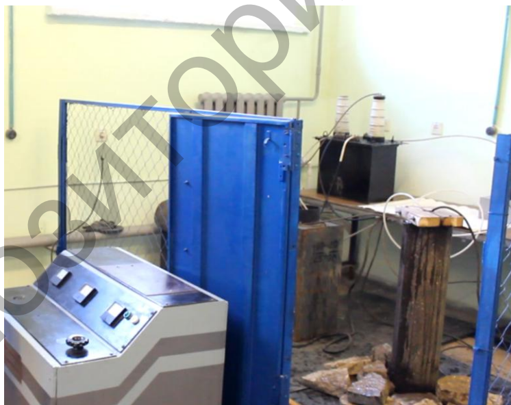
Figure1. Photograph of the general form of an electro-hydraulic plant for well drilling

To form a pulse with a short front of the voltage applied to the discharge gap in a liquid we used a discharge gap in the air that is an air discharger; and to generate a pulse of certain energy we used energy storage electrical capacitor. We have developed and tested an electro-hydraulic plant and a working cell for drilling (Fig. 1).