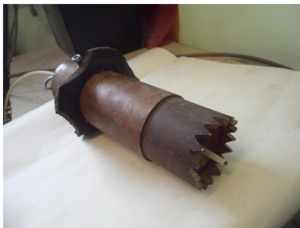
Fig. 2. The appearance of the electr-hydraulic drill

breakdown of discharger takes place and all the stored energy in the capacitor through a cable-electrode is transferred to the working clearance.