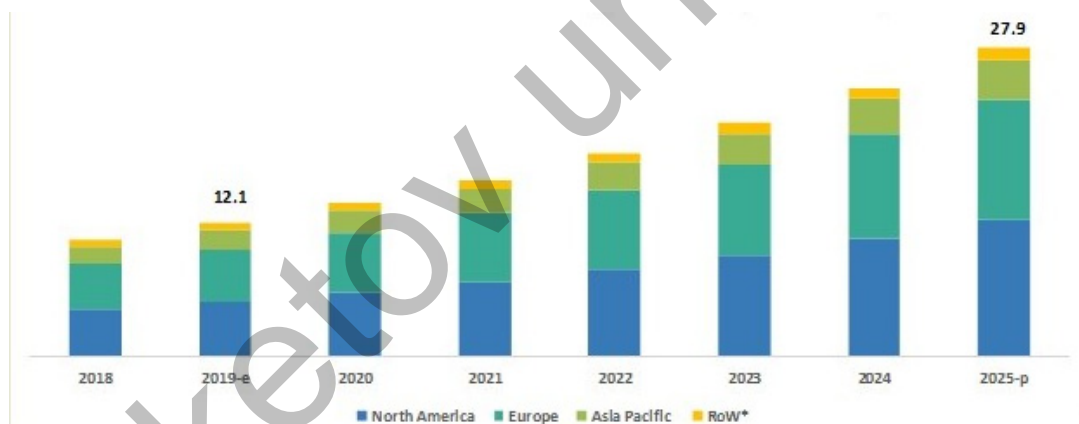
Figure 1. Plant-based meat market by region, USD billion (Food and Beverage Market Research Report, 2019).

Thus, the global market for alternative meat products in 2019 is estimated at $12.1 billion, according to Research Markets and Markets (Figure 1). By 2025, it is planned that the market will more than double.