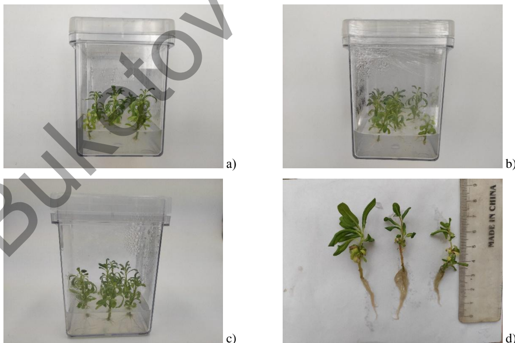
a) the first stage of development; b) the second stage of development; c) the third stage; d) the development of the root system at different stages

Figure 2 shows P. diversifolia plants at various stages of root system formation in in vitro culture.