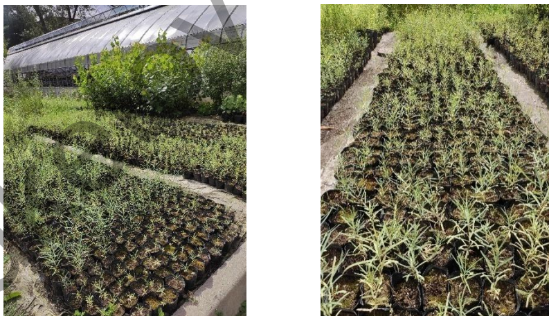
Figure 5. Hardening in the open area of P. diversifolia

Hardening of P. diversifolia for cultivation in the open ground was carried out on a site outside the greenhouse and seedlings with a height of 20–30 cm with a closed root system in containers were obtained (Fig. 5).