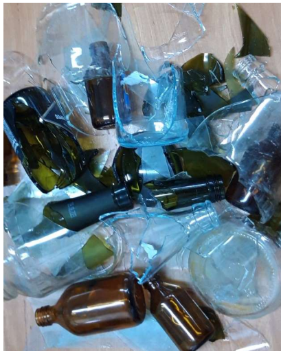
Fig. 1. Household glass waste

The object of the study was considered one of the solid household waste – cullet and household glass containers (Fig. 1).