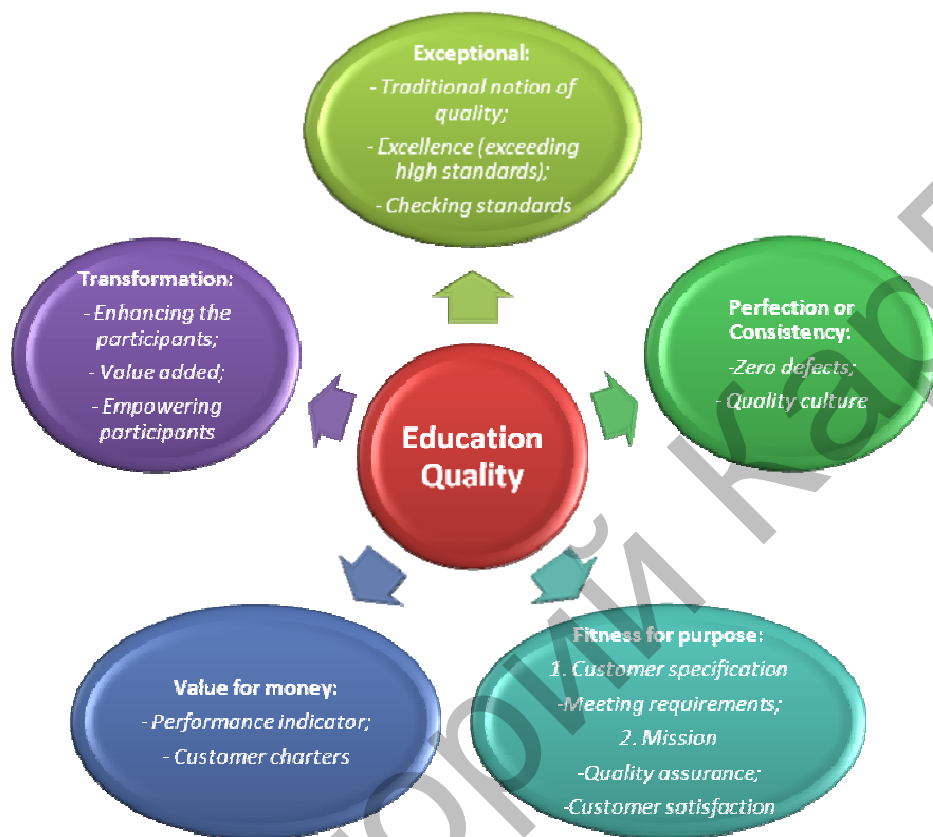
Figure 3. Quality framework by Harvey and Green (1993)

Harvey and Green [11] provide a useful framework by analysing quality into five different but inter-connected categories, namely: exception, linked to the idea of ‘excellence’; perfection or consistency, which focuses on process and the set specifications it aims to meet; fitness for purpose, which judges quality in terms of meeting stated purpose; value for money, which assesses quality in terms of return on investment or expenditure; and transformative, indicates a process of fundamental change (for full model see Fig. 3).