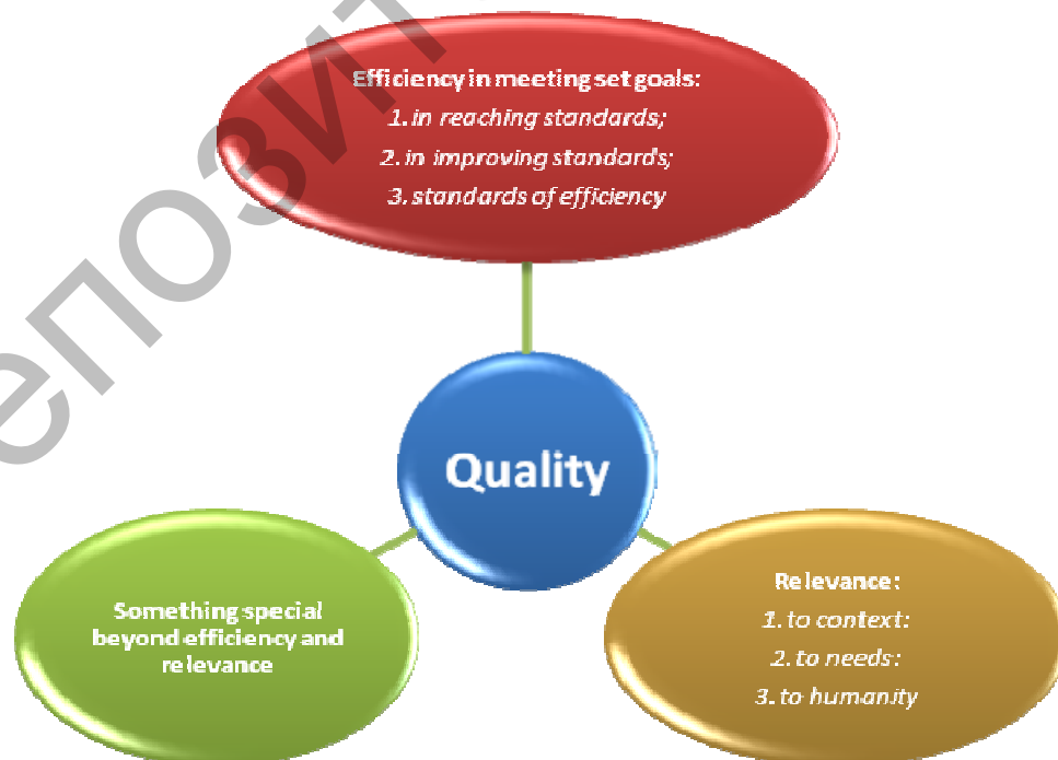
Figure 2. Quality framework by Hawes and Stephens (1990)

An approach to differentiating quality was given by Hawes and Stephens [8], where quality can imply 'efficiency in meeting set goals', 'relevance to human and environmental needs and conditions', and 'something more', in relation to the pursuit of excellence and human betterment (ibid: 11) (for full models see Fig. 2). Although, the approach is built on defining quality in primary education, it could be claimed that the approach also has relevance to HE and could be applied in the analysis of the current study.