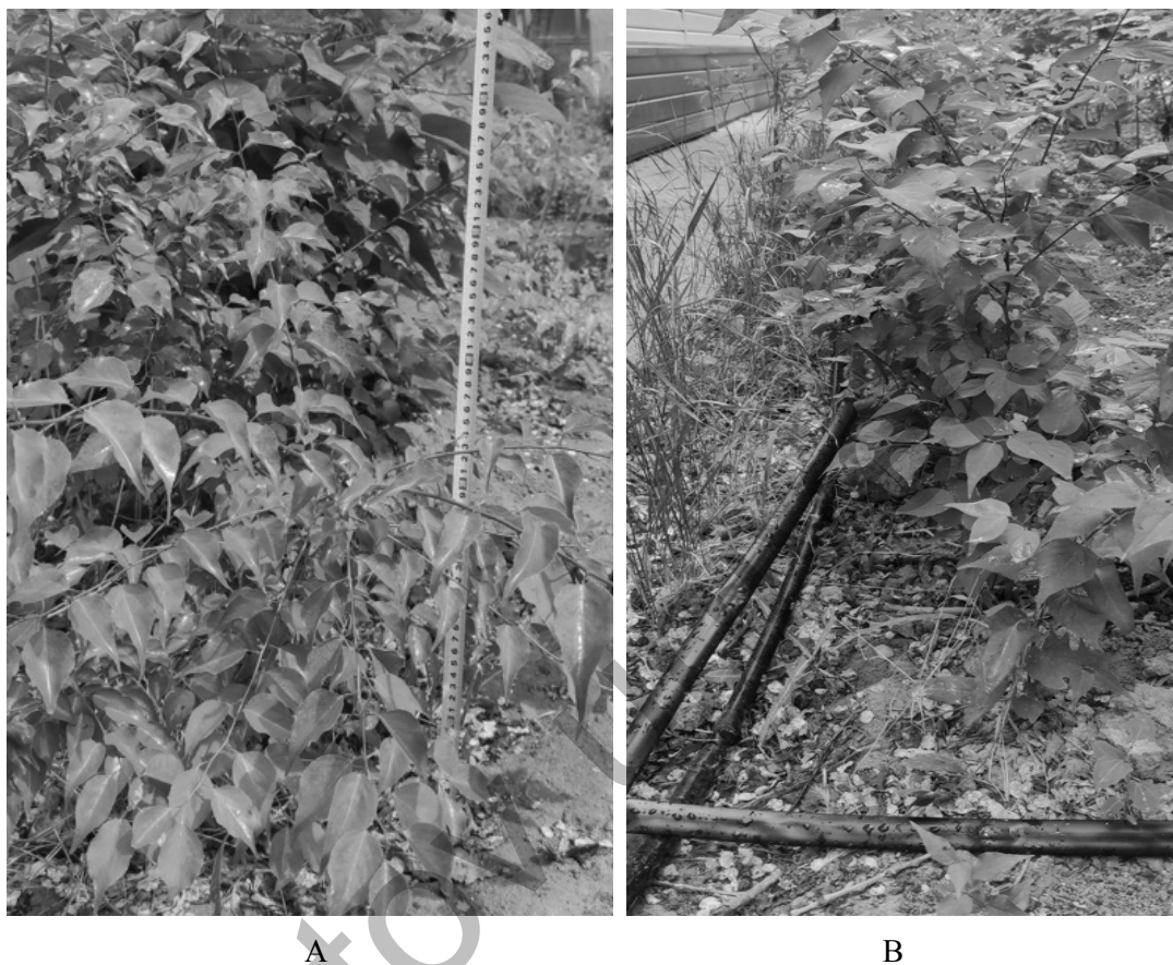
Figure 1. Samples of Armeniaca vulgaris on traditional (A) and drip (B) irrigation (Zhezkazgan city)

Leaves of Armeniaca vulgaris are taken from 2-year trees (a middle part of crown) growing at the nursery in Zhezkazgan in May-August 2020–2021 (Fig. 1); separately from plots with traditional (superficial by borowa) and drip irrigation (diameters of fleets 20 mm) [19]. The watering rate in both versions of the experience was 1.5 m 3 per season with a number of waterings at least 10 [20].