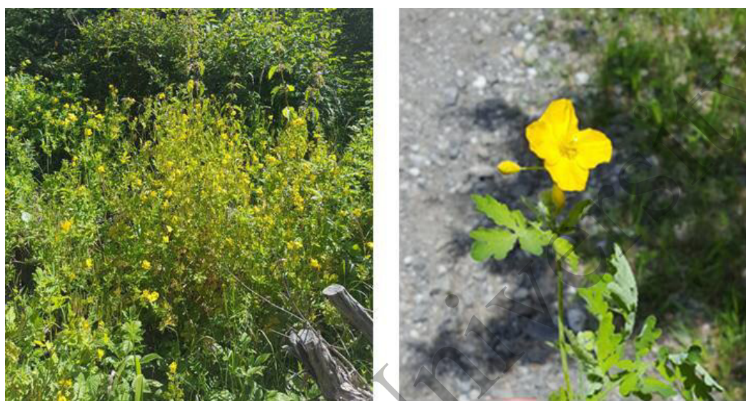
Figure 1. Chelidonium majus plant in Kungei Alatau region

The aerial parts of the C. majus plant were collected during the flowering period from the territory of Kungei Alatau, Almaty region, GPS coordinates: N 42°59'91"; E 78°20'07", 1712 m above sea level. Perennial herbaceous plant with a short rhizome (Fig. 1).