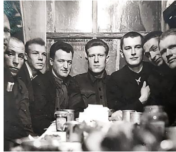
Figure 3. Lithuanian “virgin land workers”. 1955

built temporary housing in the steppe, there were no candles, vegetables, they cooked simple food themselves ... There were no young people, they went to dances ... it's not customary that in the virgin lands – hundreds of kilometres to cities and 'civilization'" (Inf. 6).