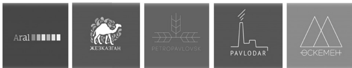
Figure 2. Historical logos

Contests held to create a brand of cities and countries are held at the following stage: