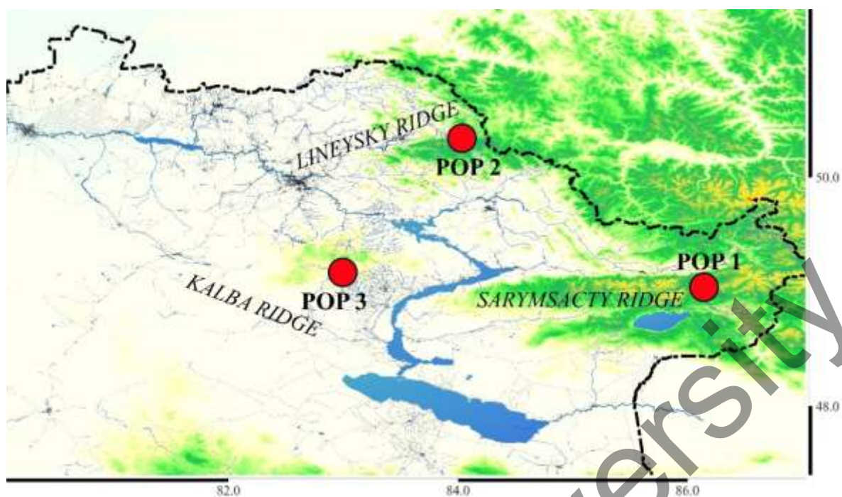
Figure 1. Location of investigated populations of A. altaicum in Kazakhstan Altai

The vegetation cover is formed by 66 species of vascular plants with a projective cover 55–85% (Table 1).