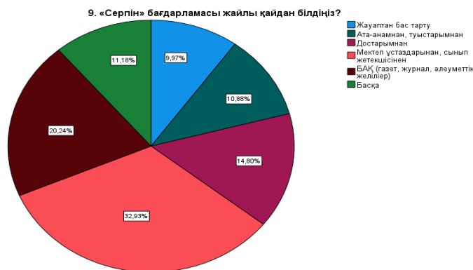
Figure 2. Distribution of respondents' answers to the question: "Where do you get information about the state program "Serpin"?"

Considering the answers to the question: "Do you plan to study within the state program "Serpin"?", we noticed that 32 % of respondents did not think about this issue, 29.6 % do not plan to study within this program, 29.3 % plan to enter universities with given the state program, 4.5 % of respondents deviated from the answer to this question.