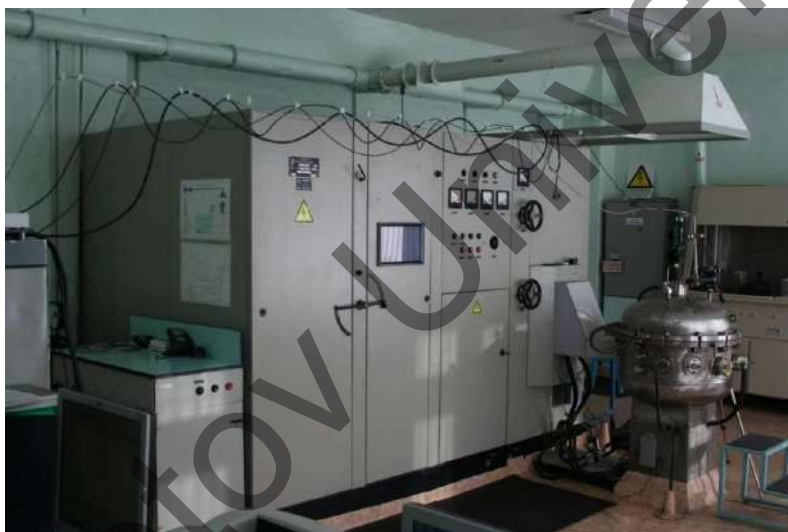
Fig.1. Outer view of the VCG-135 test-bench.

The method of physical modeling is the most effective way to confirm the operability of the proposed method, since it will allow simulating the situation of corium entering the melt trap from the reactor pressure vessel during a severe accident with a core meltdown. At the same time, experimental studies will be carried out on the VCG-135 test-bench and the Lava-B facility, created at the Institute of Atomic Energy Branch, RSE NNC RK [29]. The VCG-135 test-bench is designed to perform small-scale high-temperature material science studies of small-sized samples. The main components of the test-bench are a high-frequency electric lamp generator, a sealed, water-cooled working chamber with an inductor, a system for supplying and removing working gases into the working chamber, and an information-measuring system (IMS) of the test-bench. The appearance of the test-bench is shown in Figure 1.