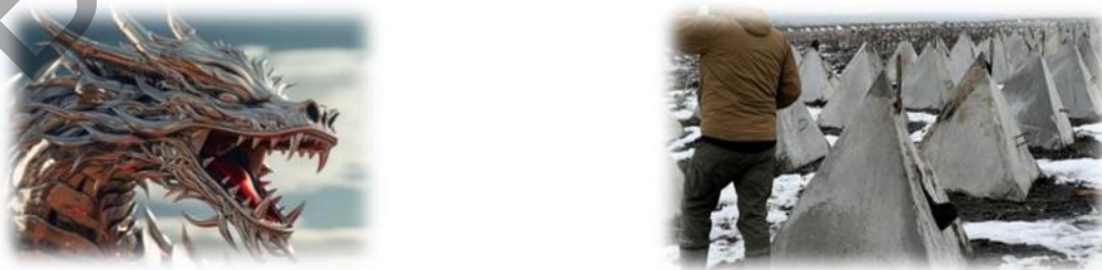
Figure 2. Dragon’s teeth (an animal) and dragon’s teeth (a fortification construction)

Built with the help of the metaphorical transfer of shape resemblance with animal’s teeth, “dragon’s teeth” offers still another fascinating example of a military engineer sapper term in the “Mythology and Religion” model. It begins in Greek mythology concerning the Phoenician Prince Cadmus and also appears in Jason’s search for the Golden Fleece. According to legend, it is believed that if their teeth were buried, they would sprout into fully equipped warriors. In the military, “dragon’s teeth” («бетонный противотанковый надолб», «невзрывные противотанковые заграждения «зубы дракона») are pyramidal anti-tank barriers made of reinforced concrete. They were first utilized during the Second World War to hinder the mobility of tanks and mechanized vehicles. The objective was to decelerate and direct tanks toward designated areas where they might be efficiently neutralized by anti-tank weaponry. Additionally, the NATO classification makes frequent use of this term. Figure 2 [27-28] provides a graphic depiction of “dragon’s teeth” in each of its meanings.