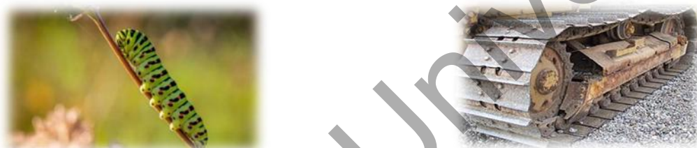
Figure 3. Caterpillar (insect larvae belonging to the order Lepidoptera) and a caterpillar track (metal chain of vehicles)

The name “ caterpillar track ” (« гусеничный трак ») has been applied to warfare as a metaphorical transfer of similarities in form and function. The motion of a caterpillar track closely matches the structure and mechanism of movement exhibited by the legs of a caterpillar, which will be presented in Figure 3 [34-35].