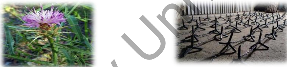
Figure 5. Caltrops (a flowery plant) and caltrops (a military barrier)

The military “ gooseberry ” («проволочное заграждение «ёж») is a basic and uncomplicated anti-ram barrier. When attempting to surmount, it elevates the vehicle above the ground, which may resemble the thorns of a gooseberry plant. This can make it challenging to reverse. Its mobility is comparatively high in comparison to that of the dragon’s teeth. It might be argued that the name of the gooseberry plant has been metaphorically transferred to military usage due to the similarity in form between its thorns and the construction of a gooseberry engineer sapper fortification. Another military term, “ caltrops ” («шип — пехотное малозаметное препятствие», «проволочные силки»), has a symbolic link to a plant. The spiny-headed flower with sharp, jagged leaves provides the name for this type of defense tool. The same name is metaphorically transferred from a military term using this plant as the foundation. In the military setting, a caltrop is a concealed barrier designed to discourage and damage individuals using spiked construction. The military caltrop can be easily associated with the botanical caltrop because of their similar form and appearance. Figure 5 provides visual evidence of the striking similarities between both [38-39].