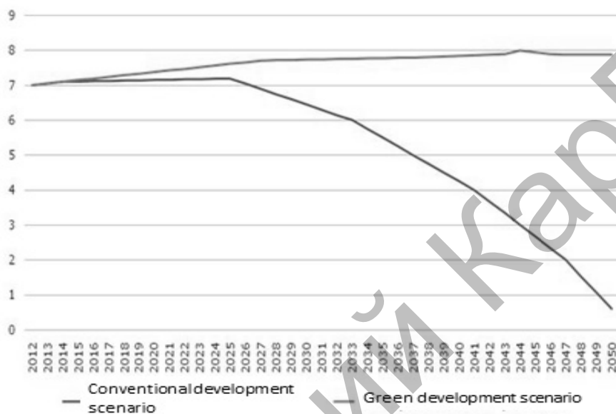
Figure 2. Projected GDP growth rates of Kazakhstan (%)

The concept of Kazakhstani transition to a «green economy» implies deep systemic transformations by increasing the well-being of the people and the quality of life of the population while minimizing the burden on the environment and the degradation of natural resources. At the same time, it is necessary to calculate GDP through natural capital and, on this basis, to implement programs on renewable energy sources (RES). Figure 2 shows comparative forecasts of development of «green» and traditional economy in Kazakhstan according to KazNIIK.