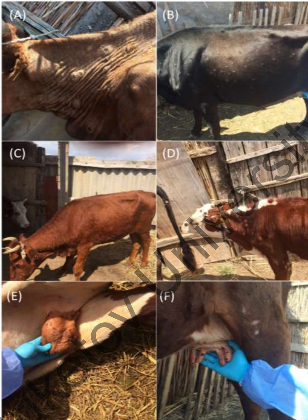
Figure 2. Cattle exhibiting LSD characteristic clinical signs in the outbreak foci in Republic of Kazakhstan in 2016. The body surface of infected animals exhibited extensive circumscribed and convex skin nodules (a-d) with ulceration of the scrotum and the teats (e-f)