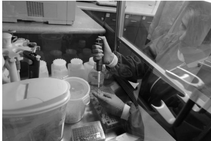
Figure 2. Pathology in action

or screen to remotely view digital images [6]. Recently telepathology has harnessed the opportunities provided by cloud computing (Fig. 2).