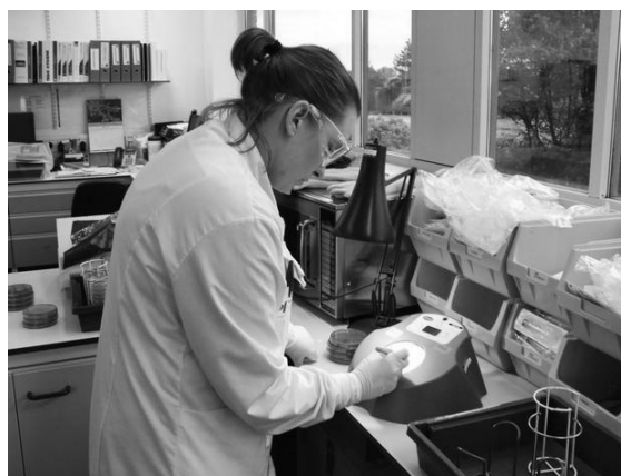
Figure 4. Laboratory worker performing colony counting