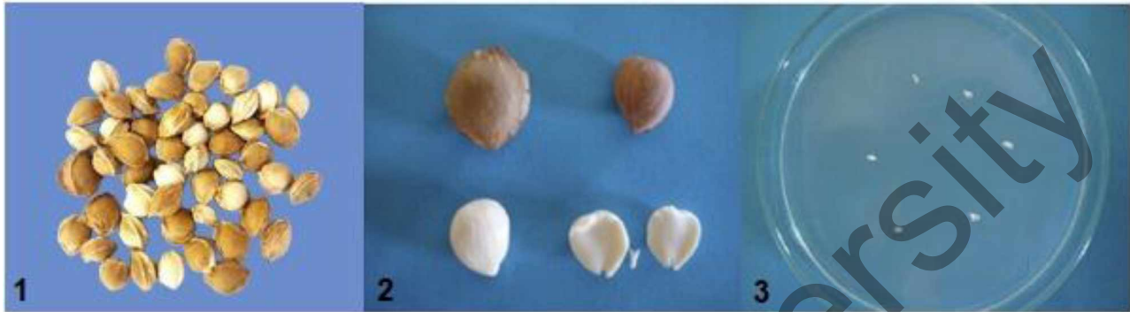
1 — apricot endocarps; 2 — endocarp and seed; 3 — embryo in medium

further work is directly related to it. Scientist Soliman H., agreeing with this opinion, in his study proposed in vitro reproduction biotechnology based on the El-Hamawey apricot variety. According to him, for successful disinfection of plant material from microflora (plant viability — 83.71 %, low contamination — 9.66 %) 1 min. It is reported that immersion in 70 % ethanol, followed by immersion in a solution containing three drops of Tween 20/500 ml of 0.75 % NaOCl for 10 min is effective and a germination ratio of 2.3 can be achieved [15]. In our experiments, disinfection of sprouts and seeds of wild types and cultivars of apricots is shown in Table 2. 30 plants were tested for each experimental variant to determine the disinfection agent.