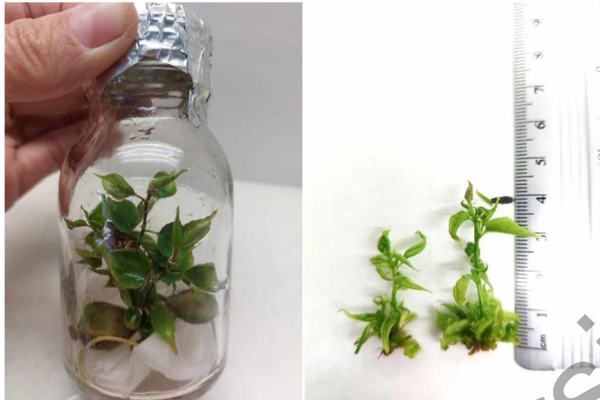
Figure 2. Growth and development of wild apricot seeds in an artificial nutrient medium for 1–3 months

The composition of the artificial nutrient medium is of considerable importance in in vitro conditions of introduced seeds and crown buds of wild apricot and cultivated apricot varieties. The number of explants capable of regeneration of the wild apricot form obtained from the Aksai Gorge is 48.5 %, the average number of explants capable of regeneration of the wild apricot form obtained from the Kotyrbulak Gorge is 37.1 %, and the cultural varieties: Balkiya 37 %, the lowest number of explants capable of regeneration is Kolkhoznyi 28 % had. Other varieties of apricot showed an average index (Fig. 2).