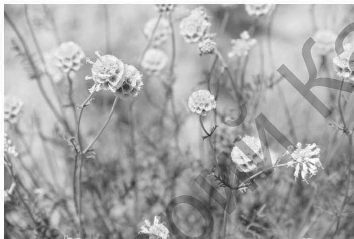
Figure 3. Flowering shoot of Scabiosa isetensis in Ulytau Mountains

For Scabiosa isetensis significant overgrowth is noted in the mountains of Ulytau and Buyratau on the dry rocky areas and slopes of hills (Fig. 3). Sometimes the growth sites of both species can intersect.