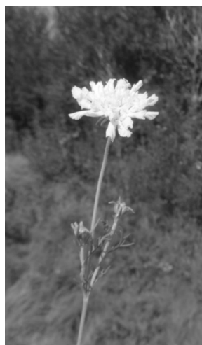
Figure 2. Flowering shoot of Scabiosa ochroleuca in Korneevsky woods

In the cereal — herbal varia community in Korneev forests (Bukhar-Zhyrau district of Karaganda region) the total projective coating was 80–85 %, the aspect of vegetation was motley-green. In the community Calamagrostis epigeios dominated with an abundance of cop1 and a vitality of 4–5 points, the subdominant was Scabiosa ochroleuca with an abundance of sp and a vitality of 5 points (Fig. 2).