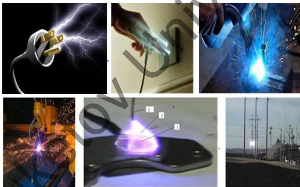
Fig.2. Emergence of electric arc