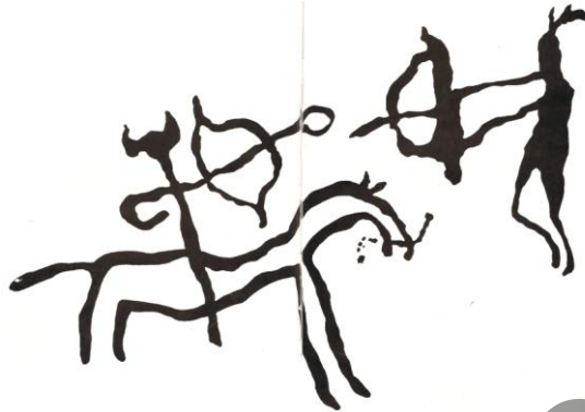
Figure 3. The war of horsemen and foot archers

The next petroglyph is “The war of horsemen and foot archers” (Figure 3) [4; 32]. Tamgaly is the south-eastern part of Mount Shuili. Mount Anyrakay is located about 170 km northwest of Almaty. An unknown artist, who painted two soldiers with bows, used two different techniques for drawing. The Archer on the horse is executed only on contour lines. The Walking Archer is depicted in the silhouette technique as a spot. The hats of the two soldiers are different. An archer on the horse looks like a soldier with two horns. The head of the second archer is shaped like a helmet. In the same way, the Bow Arrow is different and clearly visible. The head of a mounted archer resembles a round arrow of a foot archer.