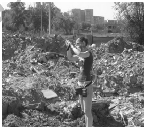
Picture 3. The Dump of construction garbage, with an asbestos waste, Karaganda, 2009 (WECF)