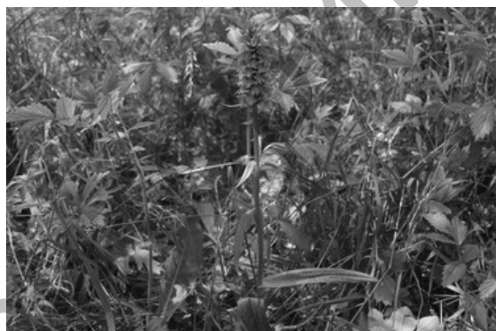
Figure 5. Dactylorhiza maculata (L.) Soo

For primary introduction into the Altai Botanical Garden, it was introduced as living plants from the southern part of the Sibin depression of the Kalba ridge. In total, 35 generative individuals were planted in culture.