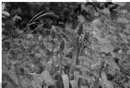
Figure 6. Dactylorhiza umbrosa (Kar. & Kir.) Nevski

For planting samples of D. umbrosa in the exposition of natural flora, areas were selected that most closely corresponded to the natural ones: with constant shading under the canopy, richly humified and moistened soil with a significant layer of ground litter. Only 15 generative plants were introduced into the culture.