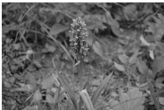
Figure 3. Dactylorhiza incarnata (L.) Soo

At abundant soil moisture without stagnation of water on the surface, a high survival rate of individuals was noted.