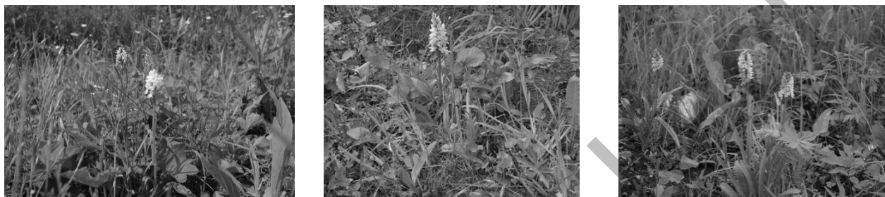
Figure 2. Different color variations of flowers Dactylorhiza fuchsii (Druce) Soo

Form pattern 3. Individuals with purple flowers, tall (most common), leaves with pale purple or deep purple spots, concentrated at the base of the leaf.