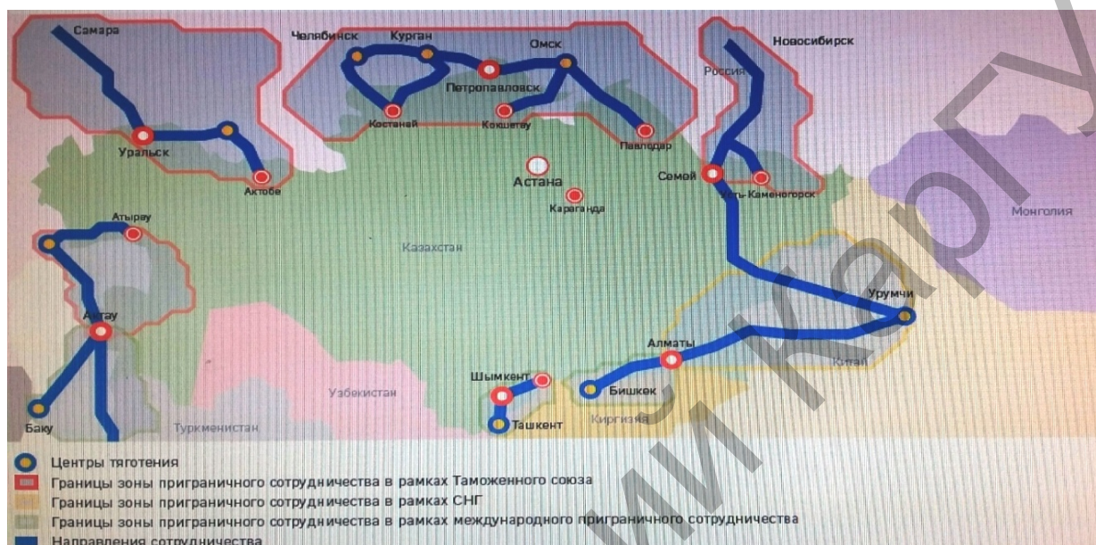
Figure 1. Scheme of border cooperation of Russia and Kazakhstan

The border-zone of Russia and Kazakhstan is presented by 12 Russian and 7 Kazakhstani regions which located along one of the most extended in the world, overland borders of two states — more than 7 thousand kilometers. Over 30 % of the population of Kazakhstan and 18,5 % of the population of Russia (in total more than 32 million people) live in the border areas of Russia and Kazakhstan. In Figure 1 the scheme of border cooperation of Russia and Kazakhstan is presented where the directions of cooperation and border of zones of border cooperation are separately highlighted.