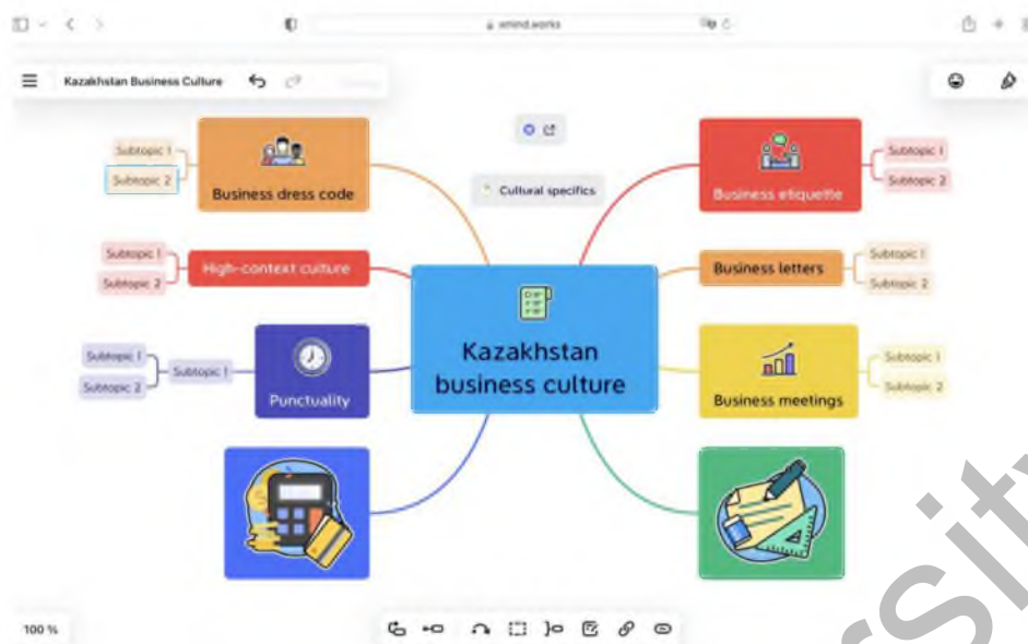
Figure 1: Example of an intelligence map in XMind ( https://xmind.works )

Work with mind maps can be structured in several stages (Fig. 2). The first stage, as a rule, is the orientation and motivation stage where general introduction to the learning material and immersion into the problem take place, the goal and objectives are formulated, background knowledge is activated and personal experience is actualized [24]. The following instructions can serve as an example of a group task: