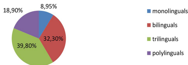
Fig. 2. Language proficiency (%)

According to the chart (Fig. 2), there is a big majority of students as the respondents who know three languages. First of all, three target languages’ proficiency that is Kazakh, Russian and English implies the working trilingual policy. There are good reasons to include the share of respondents who know four and more languages in the same group since there are target languages practically in any combination of languages specified above. The share