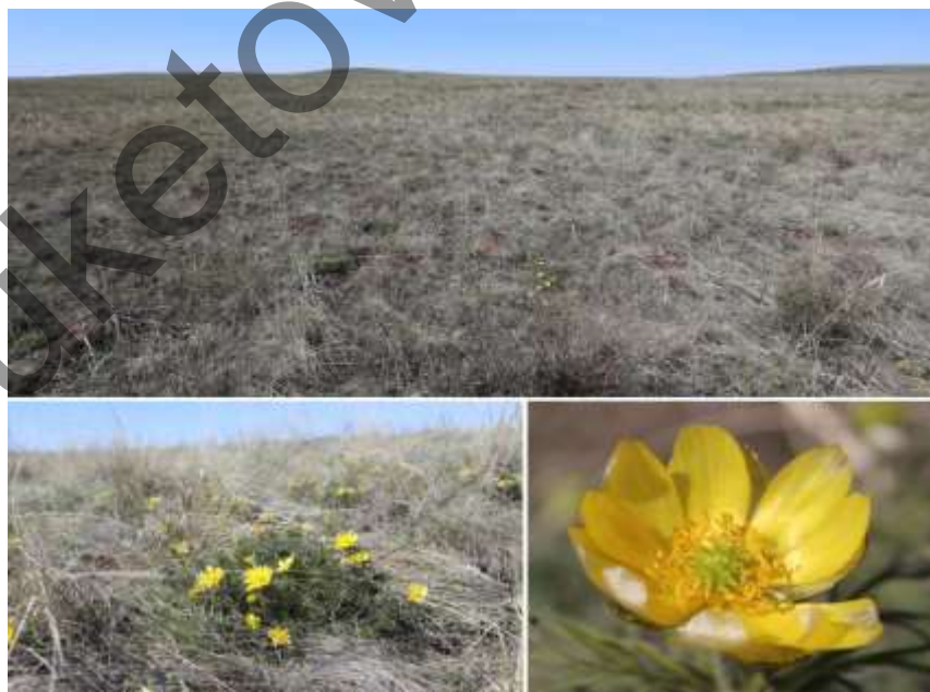
Figure 2. Period of flowering of A. wolgensis in the surrounding of village of Enbek, Akmola region

This plant has pale yellow flowers, oblong, narrow, narrowed at the ends, sometimes weakly toothed, 1-1.5 cm long and 0.5-1 cm wide; however, smaller than those of Adonis vernalis , 15-30 cm tall at the beginning of flowering, lengthening to 30-40 cm after flowering. The rhizome is erect, short, thick, with lace-like brownish-black roots. Stems solitary, with spreading branches; entire plant spreading-hairy, lower leaves brown, scaly, subsequent stem leaves twice pinnate, sessile, with 2 shortened lobes at the base; flowers 3.5-4.5 cm in diameter, petals 17-20 mm long and 6-7 mm wide; bracts globular or ovoid, sometimes drooping; fruits numerous, rounded, vaguely wrinkled, 3-4 mm long, ovoid, slightly wrinkled, pubescent, spout small, hooked downwardly bent. Nuts slightly wrinkled, hairy, about 4 mm long. The species blooms in late March-April, fruits in May-June [13]. It grows along the edges of birch forests and in mountain steppes (Fig. 2).